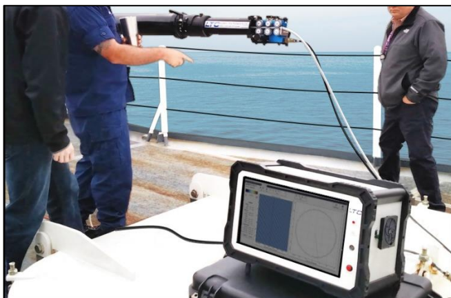
LP-5000™ deployed with BEMIS™ LC 76mm

Multiple data outputs available post-acquisition on the LP-5000 and separately with LaserViewer™ Analysis software