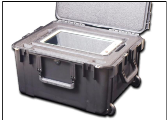
LP-5000™ Hard Sided Shipping Case